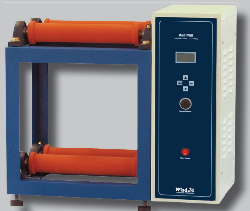
BML-2 with up to 2 places

with 2 or 6 places, 50 - 600 rpm, programmable, soundproof cabinet optional